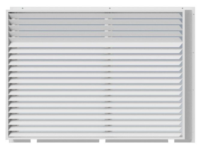
Anodized Aluminum Architectural Louver

Cancer and Reproductive Harm Cancer et Troubles de l'appareil reproducteur Cáncer y Daño Reproductivo www.P65Warnings.ca.gov LBY0057