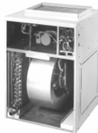
(with cooling coil installed)