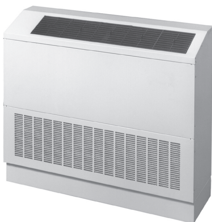
(Shown with optional floor base)