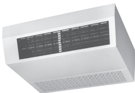
(Shown in horizontal position)

The DFCH series ductless fan coils solve almost any heating and cooling need quietly and efficiently. They require no ductwork or windows and are compatible with all major brands of split system heat pumps and condensing units. These fan coils install easily on the ceiling or wall, are simple to operate, extremely easy to service, and offer outstanding comfort. All models include factory installed R-410A TXV's. (For R-22 models, contact the factory)