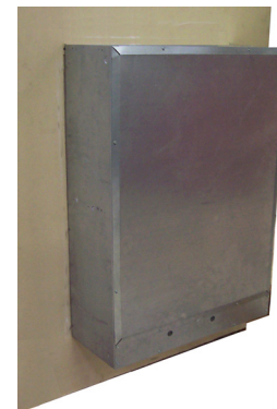
Shown with Insulation Jacket Installed

In keeping with its policy of continuous progress and product improvement, First Co. reserves the right to make changes without notice.